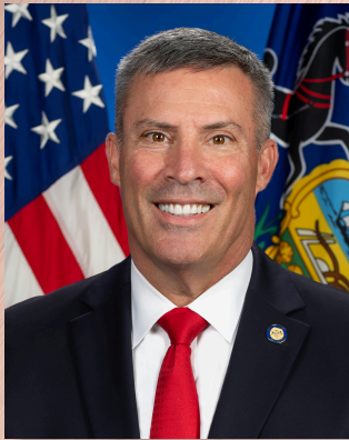
Senator Greg Rothman 34th District

Harrisburg Office Senate Box 203034 168 Main Capitol Building Harrisburg, PA 17120 717-787-1377